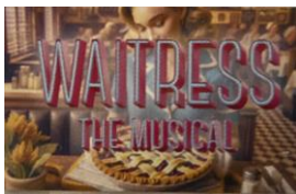
Waitress March 7 – April 6, 2025

Once again, Ilana will be arranging for Group Tickets for several shows in 2025. There are sign up sheets in the clubhouse for: